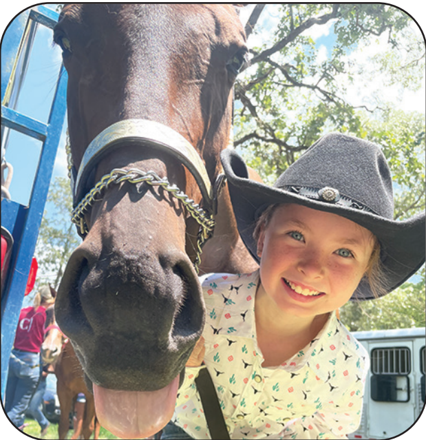
By Andi Chupp

them, I take them a treat so now when they see me coming they come right to me. They know I have a pocket full of treats for them, and I never have to walk far. Some of the other horses have figured it out too and they like to try and pick my pockets searching for my stash of goodies. It is crazy and funny all at the same time. Willis treats are usually onion grass, apples, and cucumbers. Lavender loves peppermints, apples, carrots, and any horse treats that I have. I love them both with their big and crazy personalities.